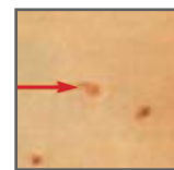
Evolves over time